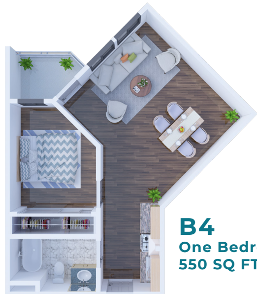
B4 One Bedroom 550 SQ FT

Solstice Senior Living at Mesa View 601 Horizon Place, Grand Junction, CO 81506 (855) 578-8536 SolsticeSeniorLivingMesaView.com