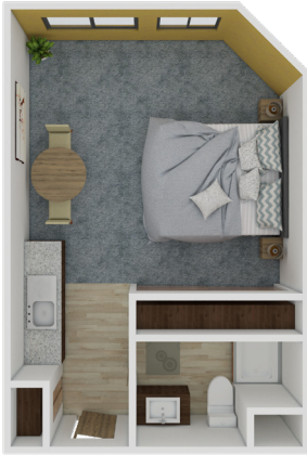
A2 Studio 400 SQ FT

Solstice Senior Living at Mesa View offers several floor plan choices to suit your needs.