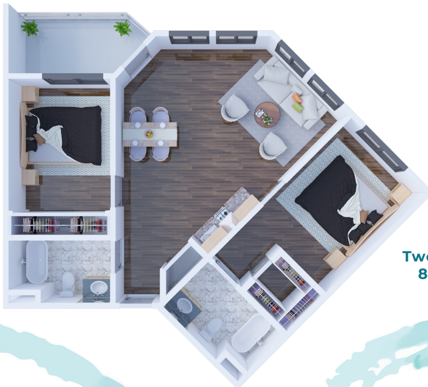
C2 Two Bedroom 890 SQ FT