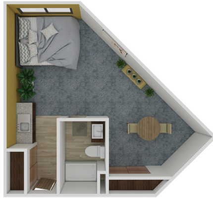
A4 Studio 490 SQ FT