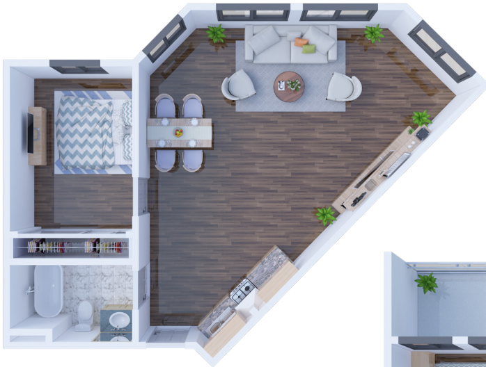
B5 One Bedroom 700 SQ FT