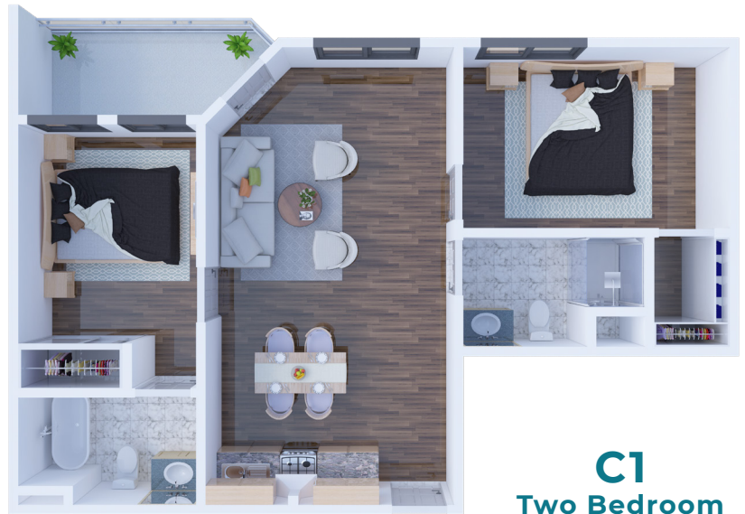
C1 Two Bedroom 860 SQ FT