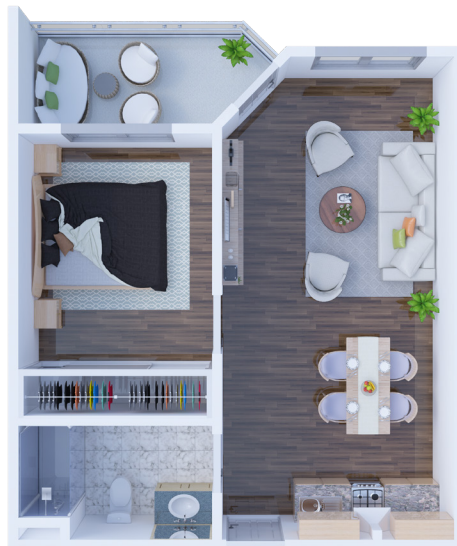
B1 One Bedroom 550 SQ FT